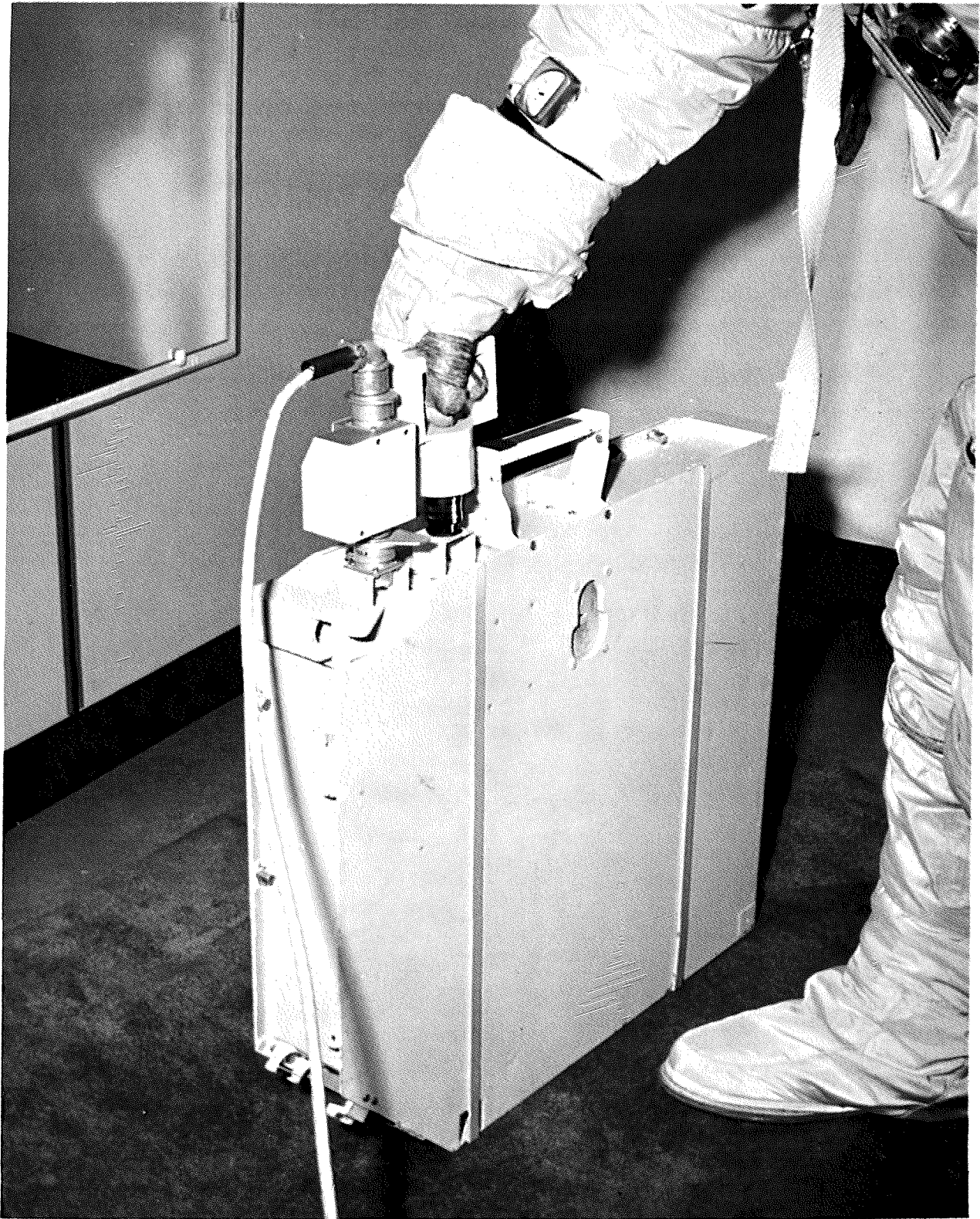
Figure 3 - Checkout of Connector Locking Quality.